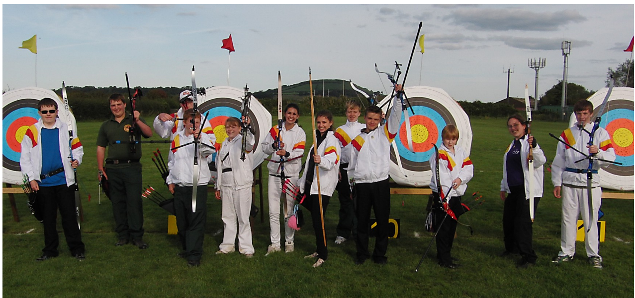
DCAS Team 2012:

We are really proud of all of our DCAS Juniors and look forward to seeing you at the indoor training sessions. Look out GWAS, we are already planning for 2013.